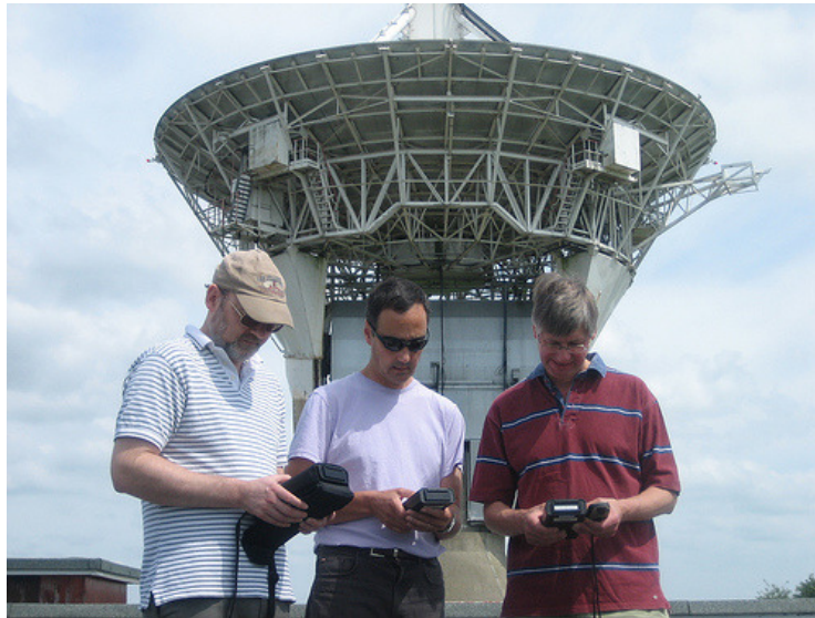
Figure 1. The three Microtops sunphotometers being compared prior to the field measurements.

Note that the date of s/n 8407 was set incorrectly to 2005, but has been corrected in the NASA Ames formatted file. This should not affect the data collected. The same instrument also did not record the water vapour amount, so this is shown as -999.0 in the data file.